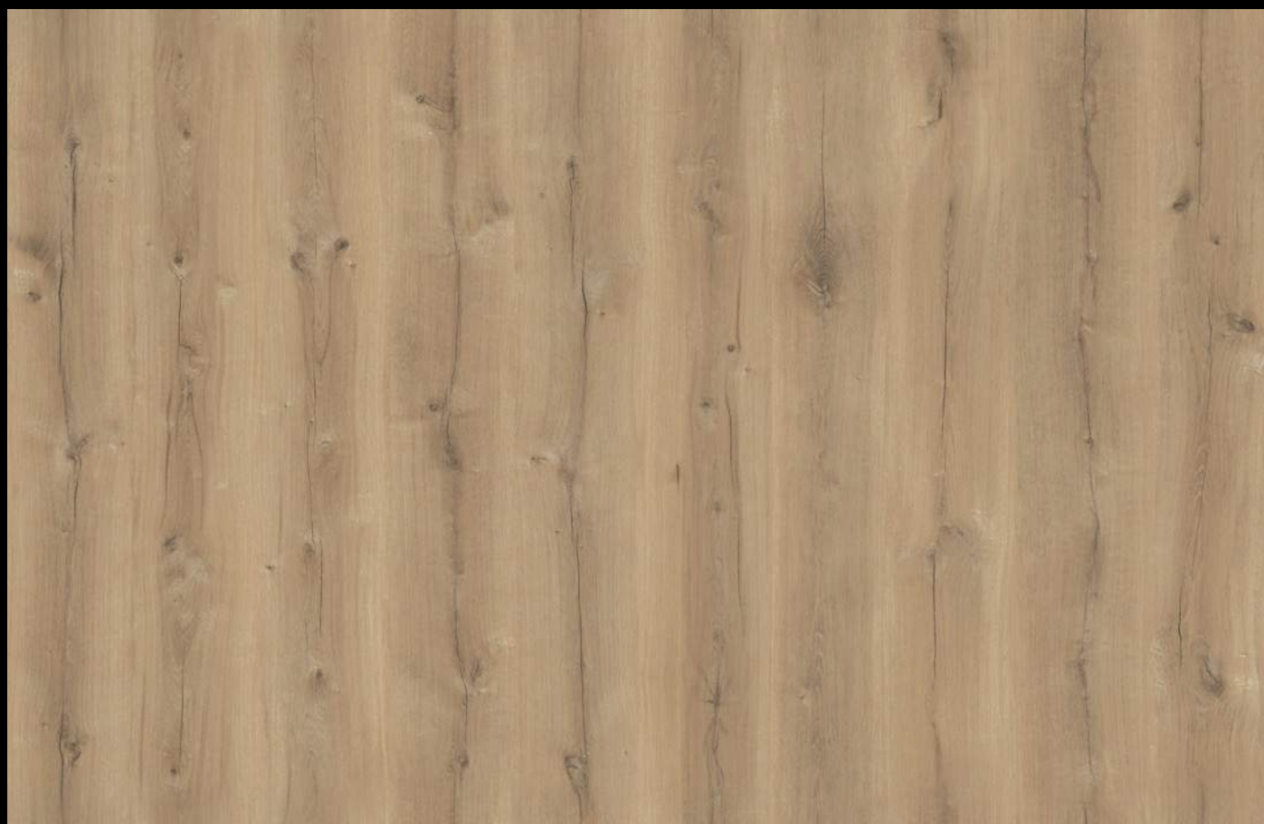
Royal Oak - 7030