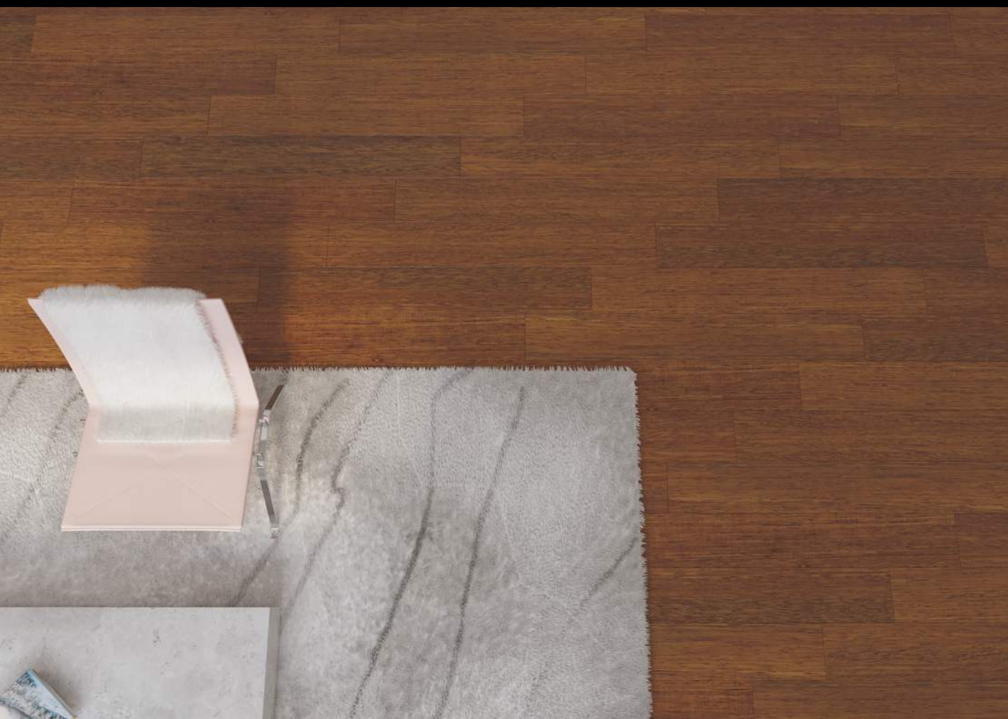
Merbau – W4118