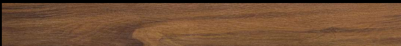
American Walnut – LS7100