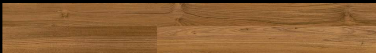
Teak select – LS-356