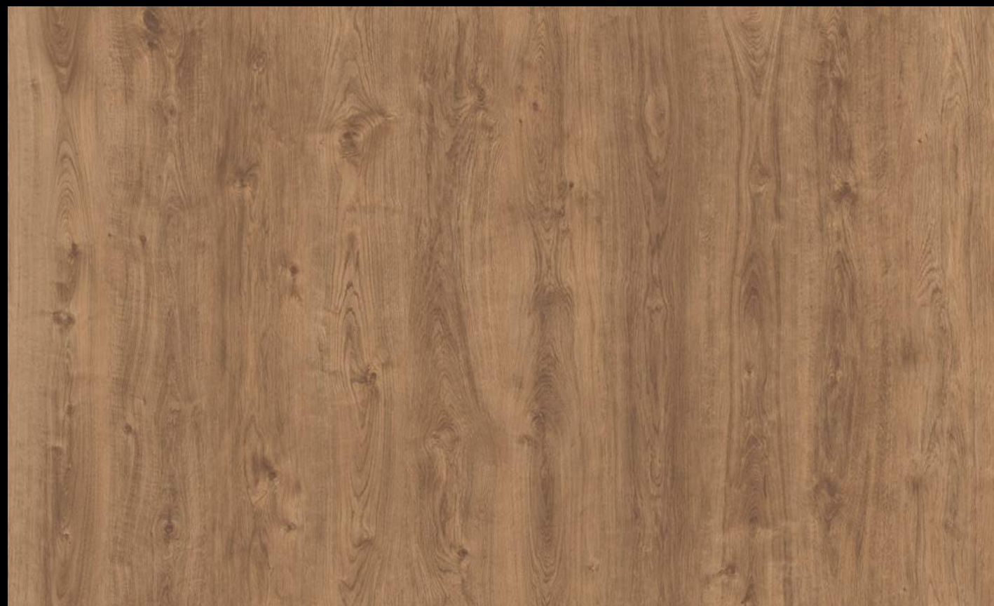
BEST OAK – LS 7040